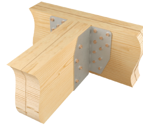
Typical THDHQ28-2 SCL installation